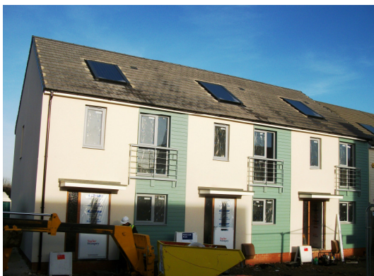
Front of properties

Plots 3001, 3002, 3003 Stoke Gifford, South Gloucestershire