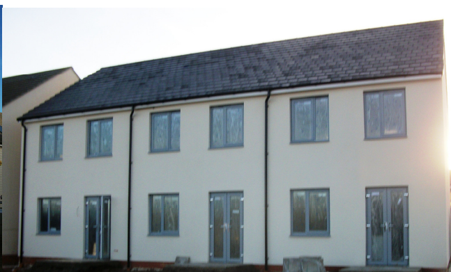
Rear of properties

These plots are due to be complete in April 2012